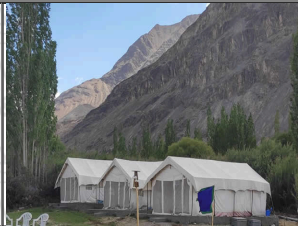
NUBRA & PANGONG